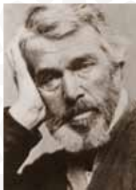
• Thomas Carlyle